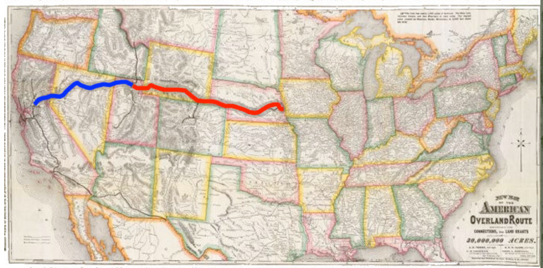
Orders for Tickers however Eastern Gries and all Points reached to the Spine and Control Poolic Lines one to purchased at the Co.'s offices in Option and Streets, New York and Linear for all Trans-Pacific Pools, and for the series any around the Wayling